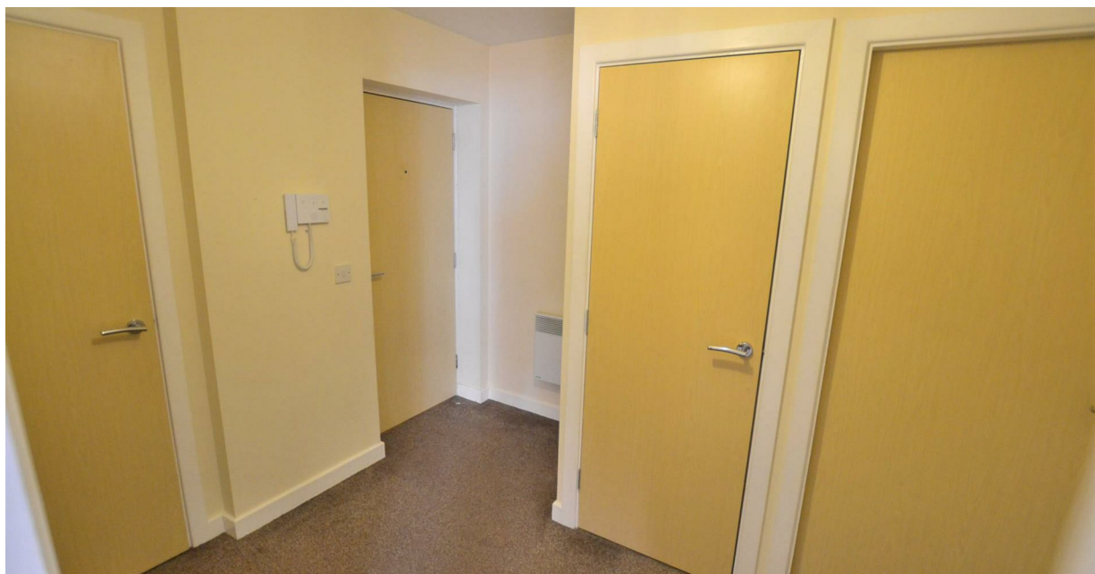
Flat 4, 18 Kidger Close, Shepshed, LE12 9UQ