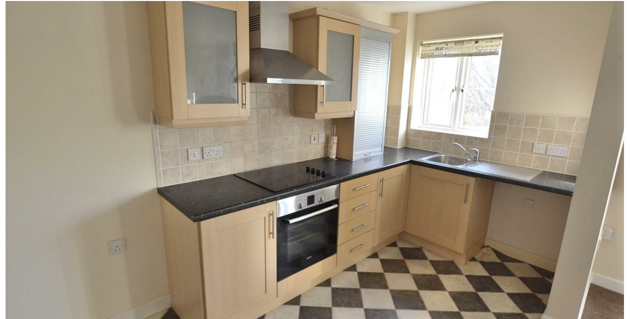
Flat 4, 18 Kidger Close, Shepshed, LE12 9UQ